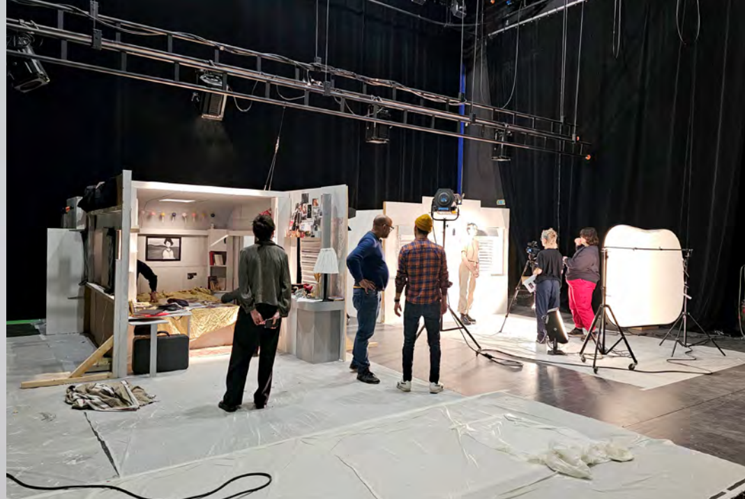
Video workshop/Film set