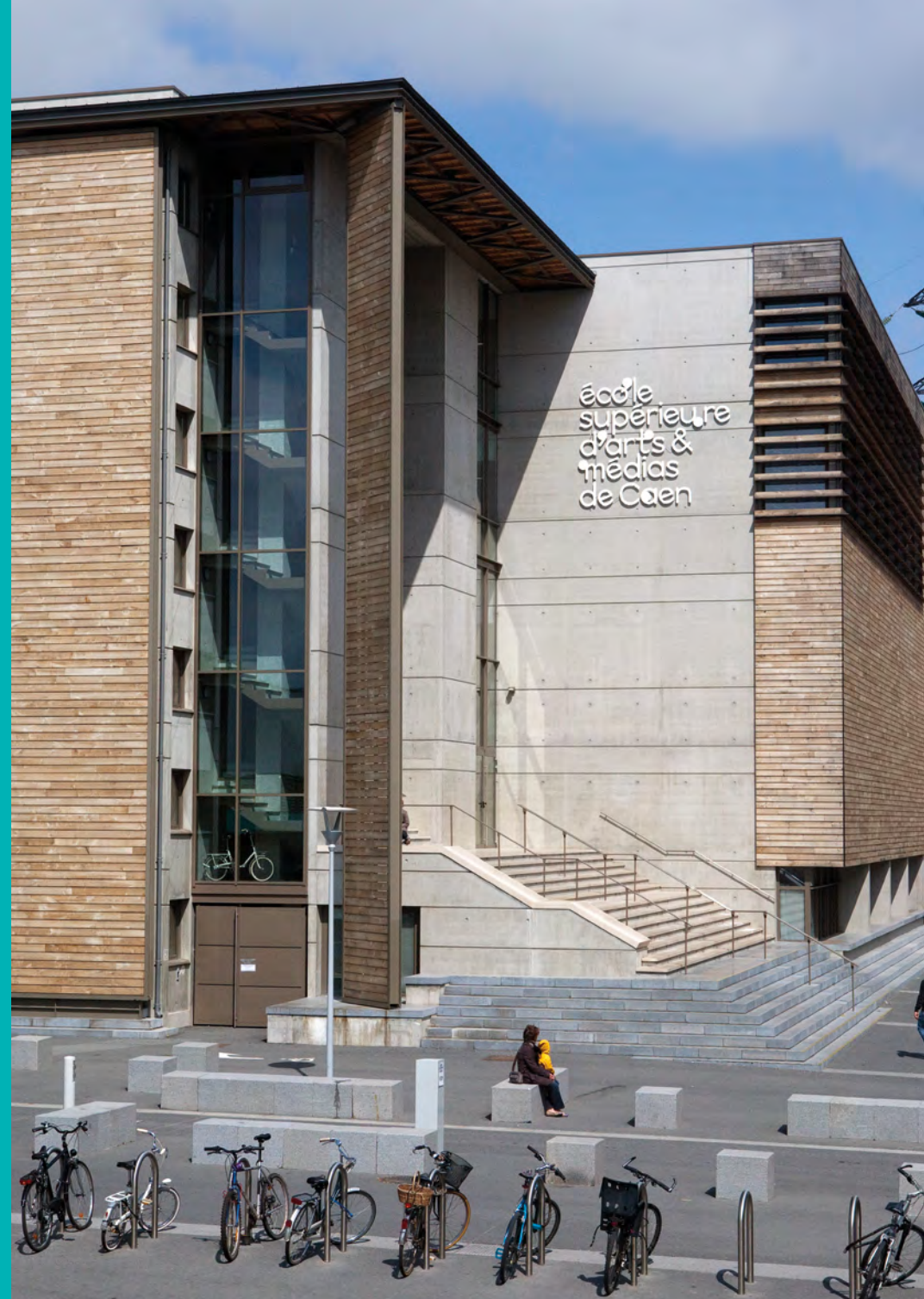
ésam Caen/Cherbourg — Caen campus

We believe that critical and reflective inquiry extends beyond written analysis and is best explored through art and design creation itself. Research at ésam Caen/Cherbourg is shaped by projects led by our faculty and through the innovative practice-led PhD program, RADIANT—one of the few PhDs in France that enables research through artistic creation.