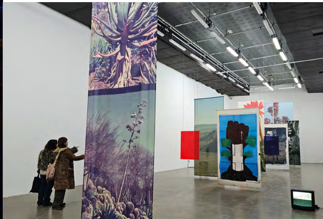
Manon Recordon, Roses snatched from concrete , PhD RADIATION exhibition, 2024