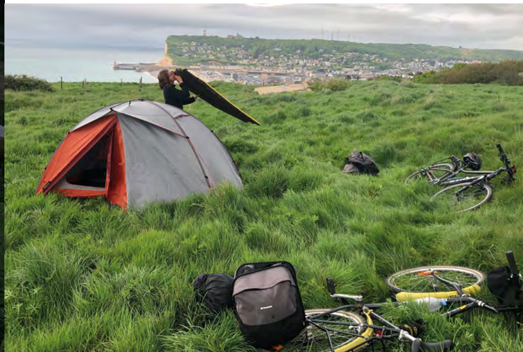
DNSEP/Master Degree Design/Transitions, journey from Caen to Bruxelles, 2023