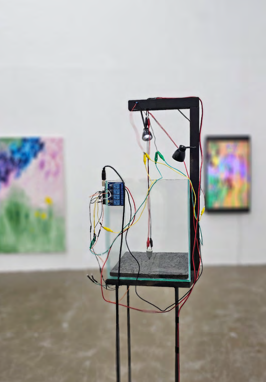
Tanguy Gravelais, Dead Cat Bounce , graduates' exhibition, 2023