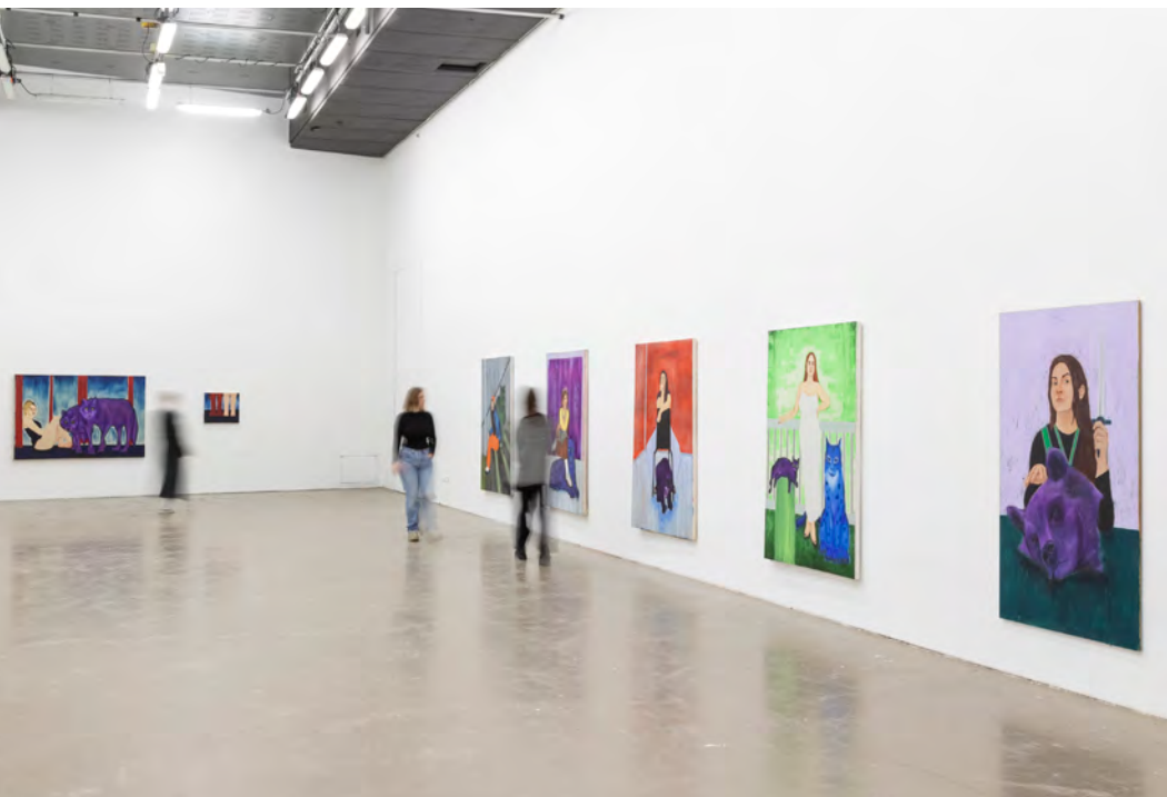
Cléophrée Barazer, DNSEP/Master Degree in Fine Arts, 2024