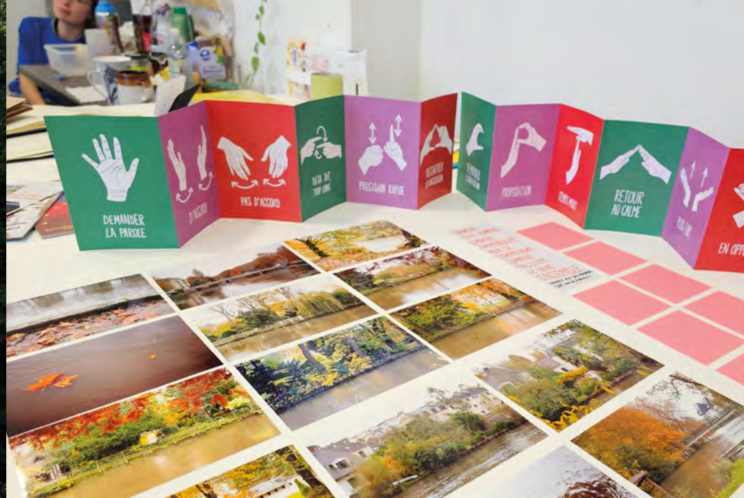
DNSEP/Master Degree Design/Transitions